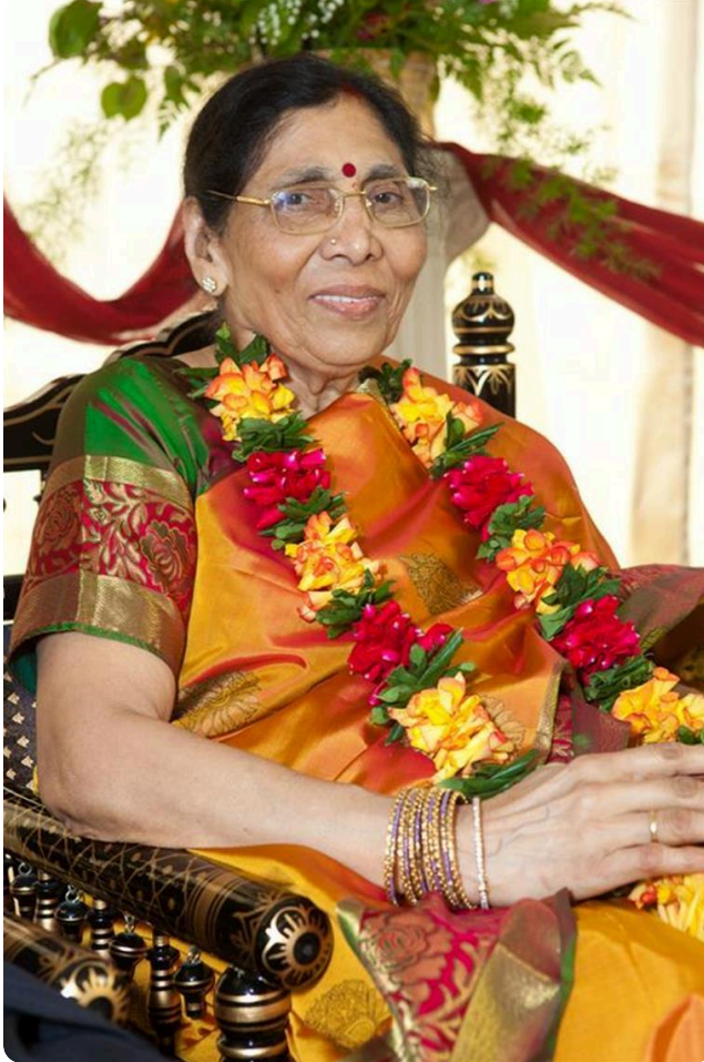
60th Diamond Wedding Anniversary