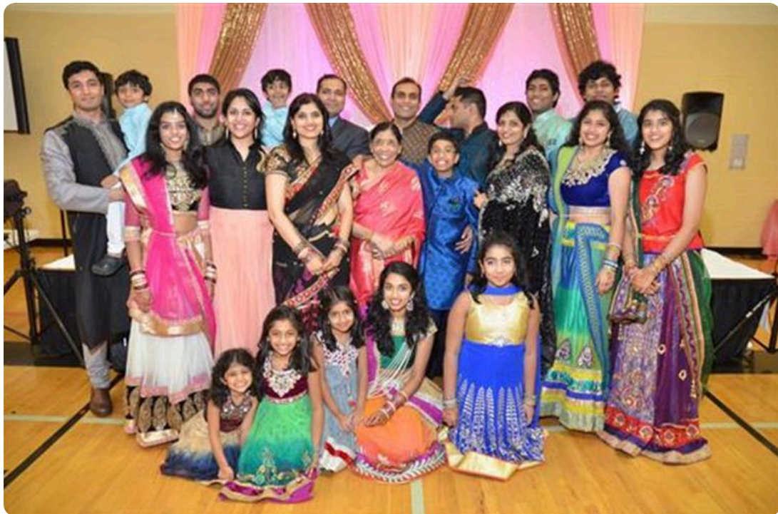
Amma with Grand Kids