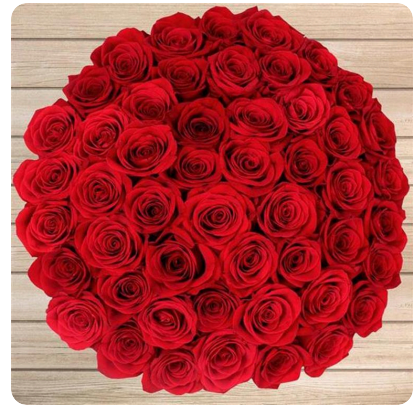
Roses for the SweetHeart